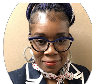
IyaSokoya Karade Athletic Arts Academy athletic-arts-academy.org @AthleticArtsAcademy